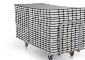
Transport trolley for the foam 1522178