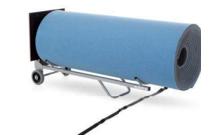
Transport trolley 1590055