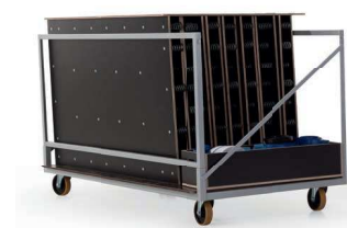
Transport trolley 1590050