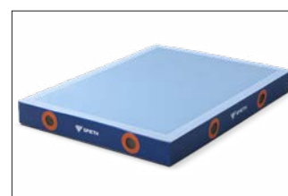
Basic mats Bisonyl cover