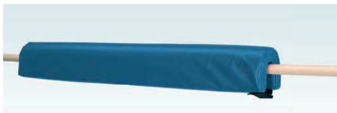
Protection pad: 1760303