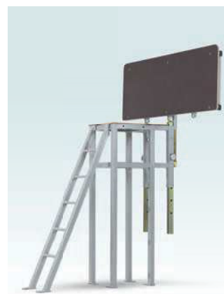
Trainer console: 1490373