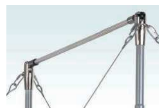
High-tensile steel rail with safety cable