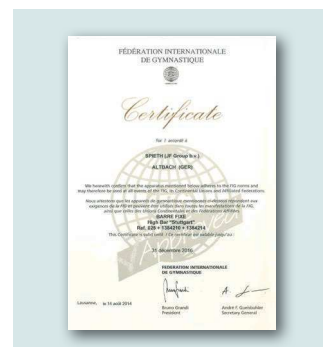
FIG certified competition model